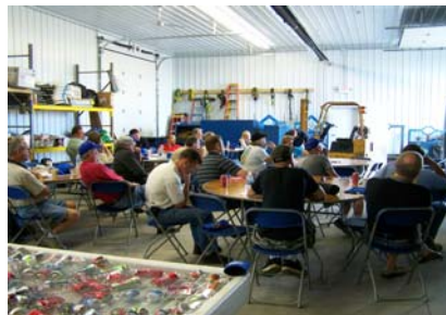
Craft and supervision came to Clearwater, MN from all reaches of the country. The numbers have grown every year.

The classes were held at the corporate headquarters in Clearwater, MN in June. The attendees were trained and brought up to speed on many items, CPR and First Aid just to name a few. The industry training on new tooling technology was hosted by various tool representatives and was very informative to say the least.