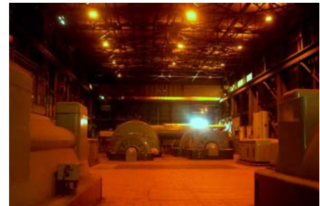
GE Cross Compound Steam Turbine

Although the outage was extended due to unforeseen repair issues, the schedule was monitored closely and communication was fluid between both RRI and S.T. Cotter. This communication makes contract changes seamless and all aspects of the project flow together.